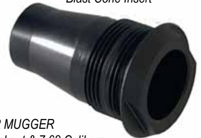
Blast Cone Insert

CQT Weapon Systems muzzle devices are manufactured out of 4140. Our line of muzzle devices are designed to reduce muzzle blast and rise. The two piece design allows the ability to interchange inserts. Each insert is designed to provide a unique shooting experience. The 'Blast Cone' insert is a true disruption design. While the 'Linear' insert is meant for a very smooth linear dispersing of gases. Each insert reduces or eliminates the blow back and pressure felt on the shooter while keeping the gun level. Three unique designs are available in 1/2-28 and 5/8-24 threads, Cabalistic, Arcane and Hugger-Mugger.