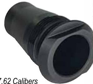
Blast Cone Insert

9mm, 5.56, 300 Blackout & 7.62 Calibers 1/2-28 Thread & 5/8-24 Thread