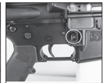
Figure 3 - Depress mag release to remove magazine.

Always wear eye and ear protection when using any firearm.