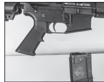
Figure 1 - Place magazine into magazine well.

CAUTION: Never load cartridge by hand directly into the chamber.