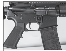
Figure 2 - Push firmly on bottom of magazine to make properly seated.