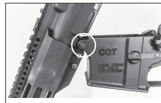
Take Down pin.